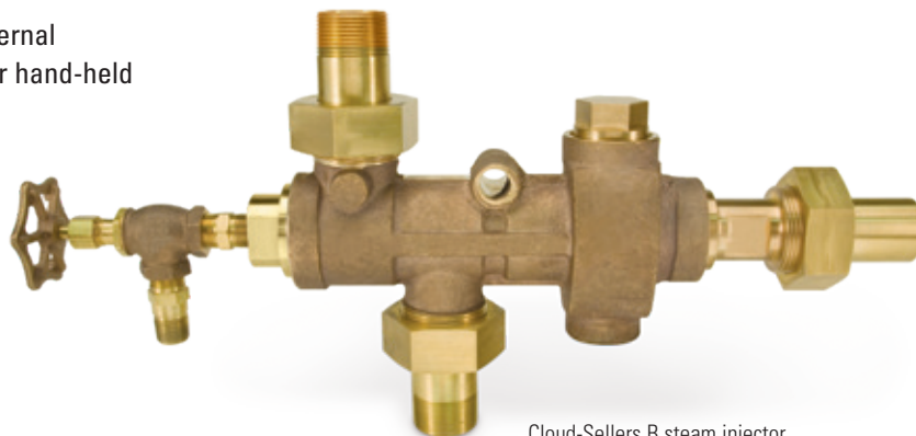
Cloud-Sellers B steam injector for liquid discharge capacities up to 34 gpm (129 lpm)